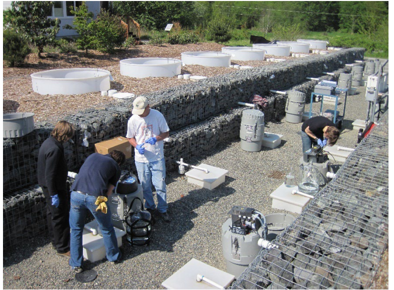
Herrera working at Washington State University LID Research Facility Database Development and Support

Herrera's California-based engineers and scientists have the availability to support projects as they arise. Herrera is committed to supporting the Santa Clara Valley Urban Runoff Pollution Prevention Program and performing exceptional work.