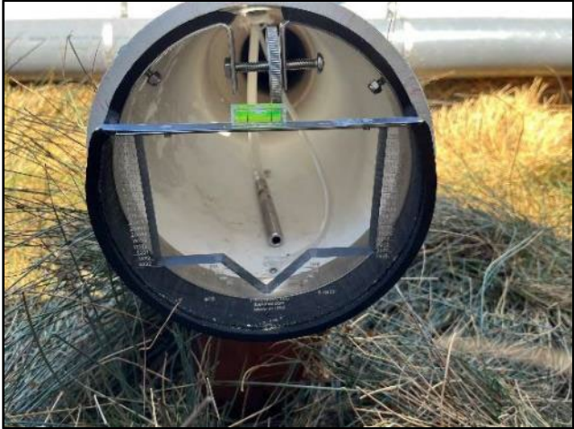
Figure 3.2. Influent collection device, weir, and ISCO enclosure at the Top Golf Public Green Streets Project in San José, CA.