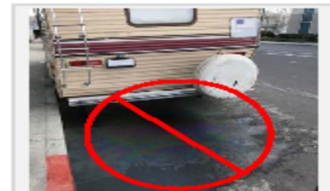
Never dump anything in the street