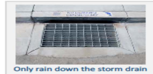
Only rain down the storm drain