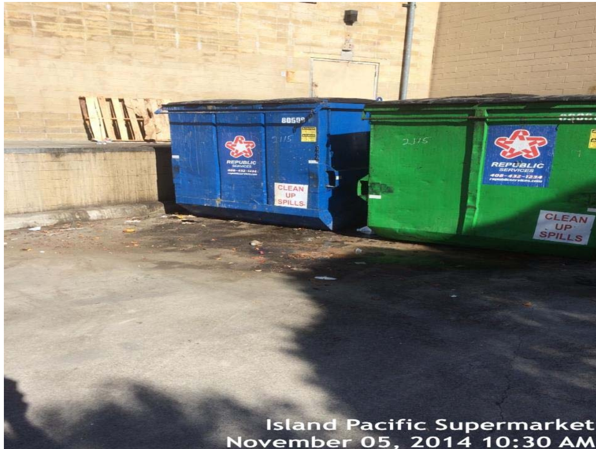
Island Pacific Supermarket November 05, 2014 10:30 AM