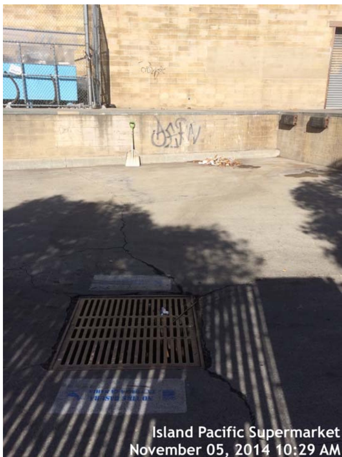
Island Pacific Supermarket November 05, 2014 10:29 AM