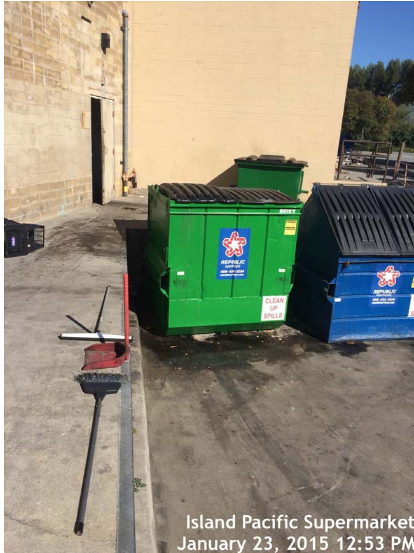
Island Pacific Supermarket January 23, 2015 12:53 PM