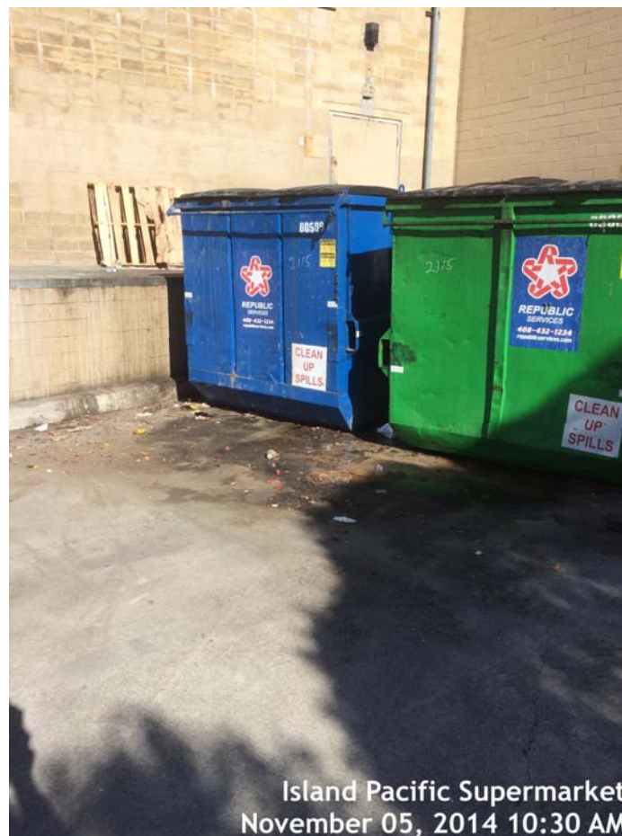
Island Pacific Supermarket November 05, 2014 10:30 AM