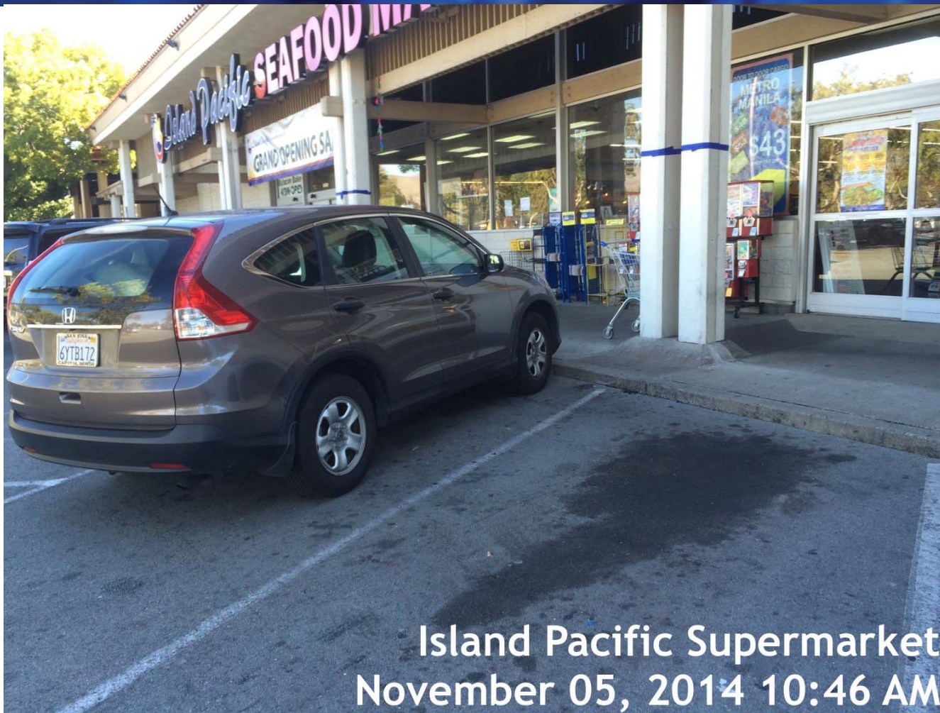
Island Pacific Supermarket November 05, 2014 10:46 AM

This is a locally owned supermarket and FSE