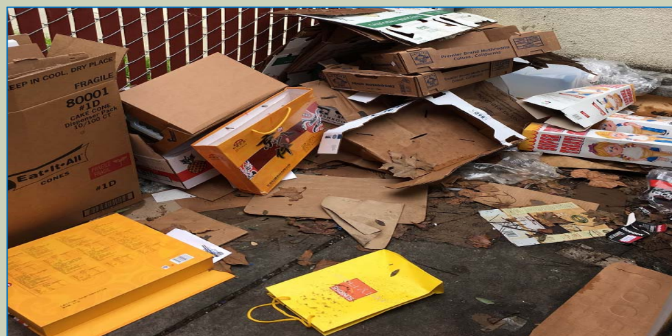
Empty recycle bin and cardboard boxes all around