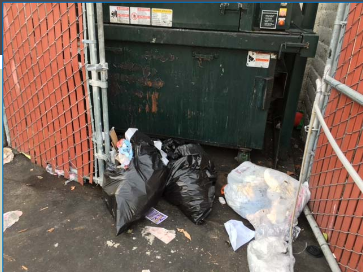
Trash bags thrown outside compactor