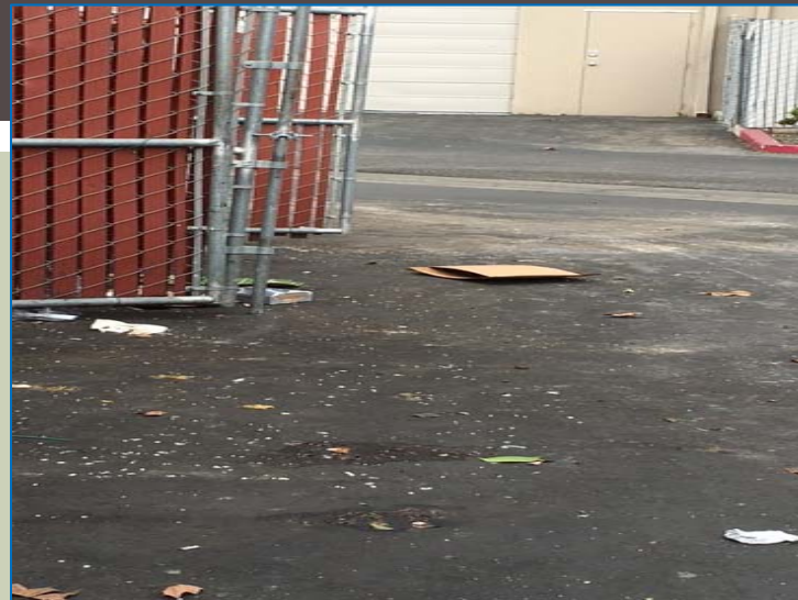
Excessive trash in parking area and in the trash enclosure