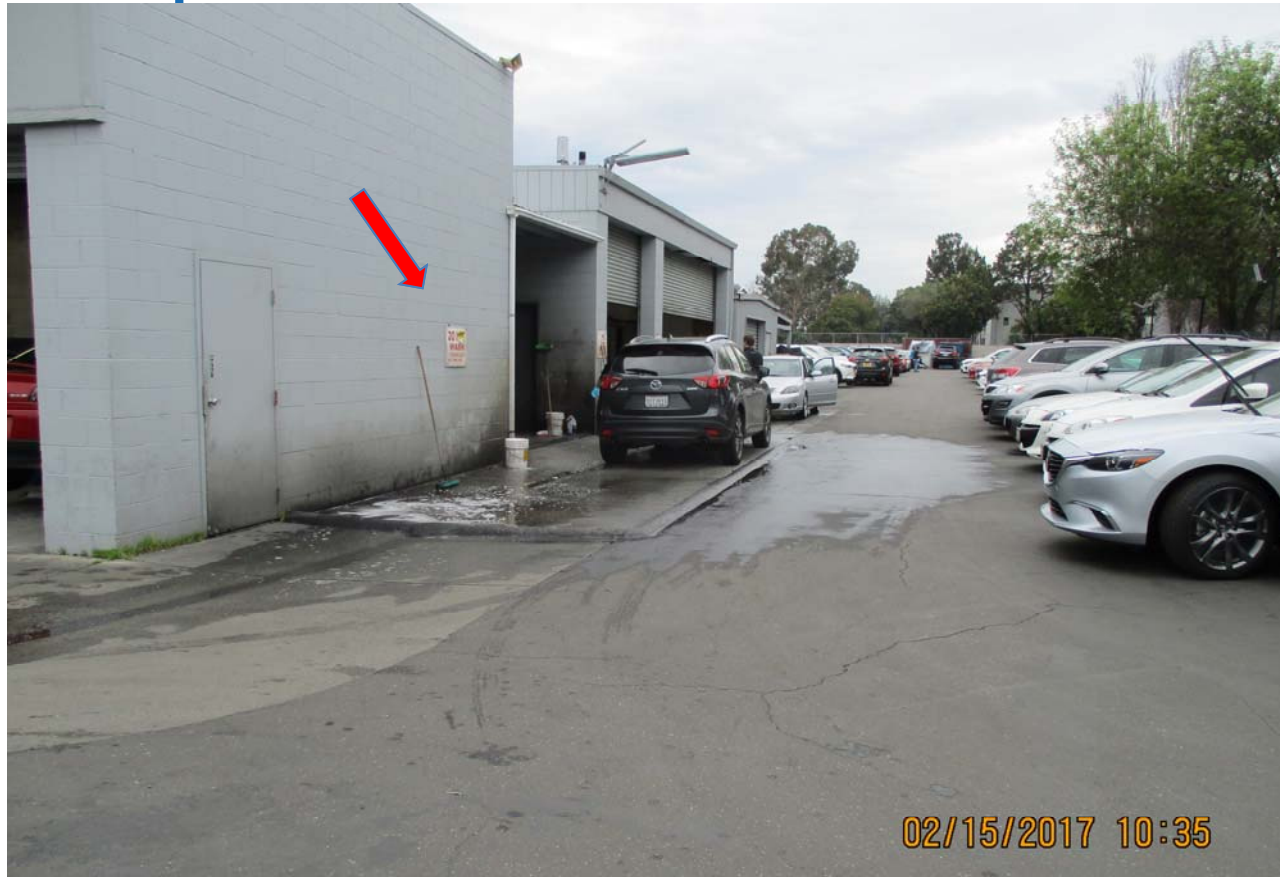
Car washing observed outside of bermed area